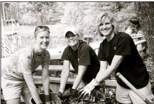
Much mulch was spread at the campfire area.