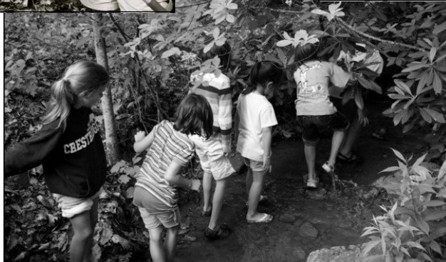
A perennial camp favorite: kids playing in the creek!